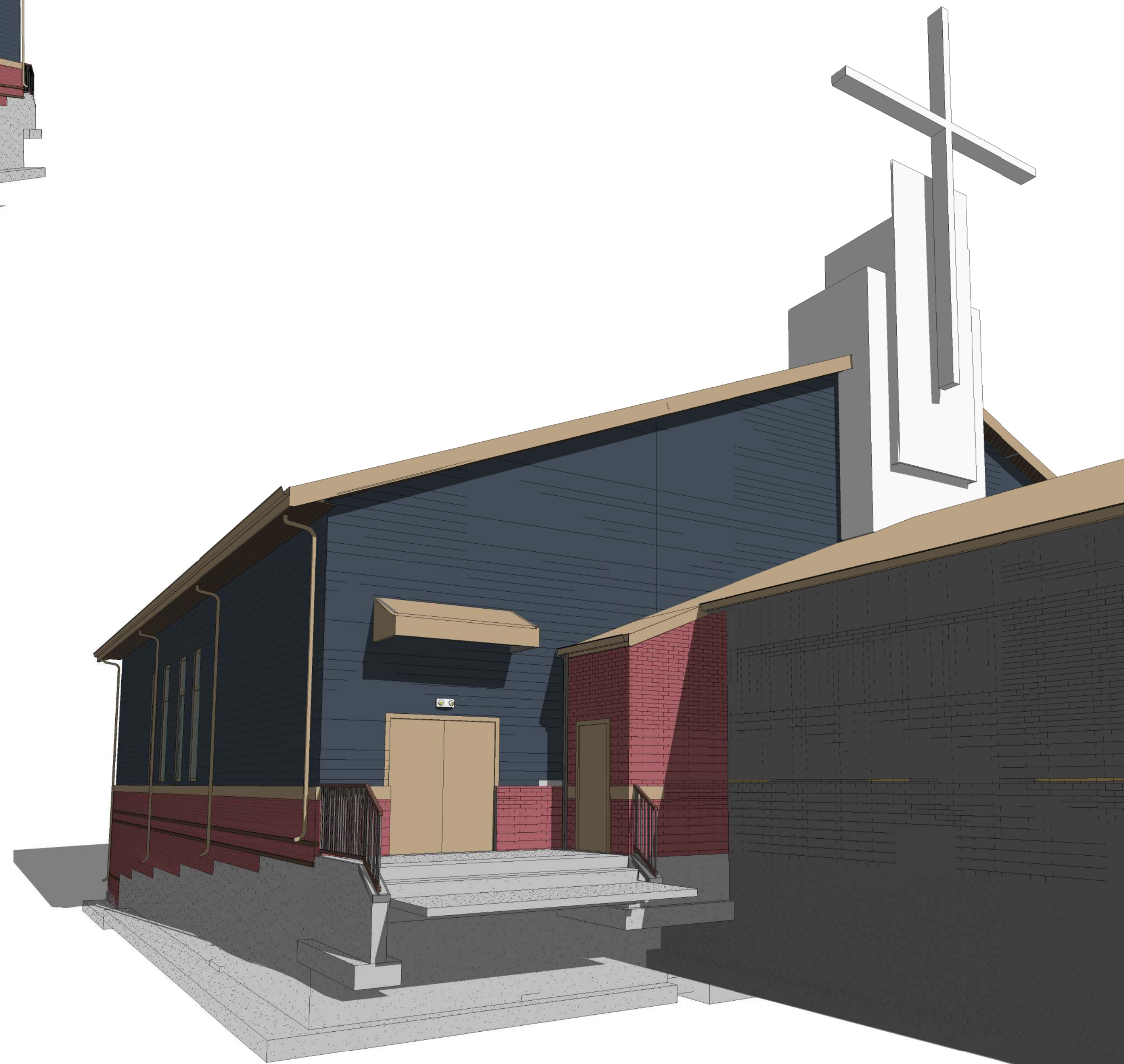
3 3D View 6